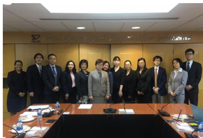
The staff of JUAA and TWAEA attended the interagency seminar of exchange hosted by the Thai Office for National Education Standards and Quality Assessment (ONESQA)

In addition, the International Joint Accreditation Project, TWAEA, JUAA and the Thai Office for National Education Standards and Quality Assessment (ONESQA) have since 2017 exchanged staff among the three organizations. Staff exchanges continued in 2018 with seminars and discussion forums. The first two exchanges were hosted by JUAA and TWAEA, and in February 2019 ONESQA organized an interagency exchange for the first time in Thailand. This year's theme is "Preparedness of EQA Agency in a Disruptive World." In addition to attending seminars and discussion forums, participating staff visited Thailand's Office of the Higher Education Commission (OHEC, Ministry of Education) and the campus of Srinakharinwirot University in Bangkok. The three sides are expected to benefit from continued exchanges and increase their professional expertise by strengthening their understanding of different education systems and international evaluation mechanisms.