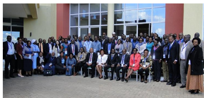
EAQAN Forum, 7-10 May 2018, Kigali, Rwanda

EAQAN is a network of quality assurance practitioners in the East African Community. The Network was formally established in 2012 and since then holds a quality assurance forum in May every year. The event attracts more than 150 participants from the region and beyond. These are drawn from the more than 130 member Universities of the Inter-University Council for East Africa (IUCEA). The annual forum, organized with the support of IUCEA, brings together stakeholders in higher education, and quality assurance in particular, to share on common themes related to quality and higher education in East Africa. The stakeholders usually include policy and decision makers in the region and beyond. The forum provides an opportunity for EAQAN members to present papers and share best practices and experiences on key issues of quality assurance, quality enhancement and networking opportunity with other QA practitioners regionally and internationally.